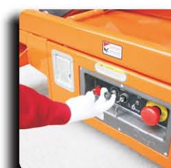
Emergency Lowering System