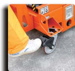
Castor With Brake