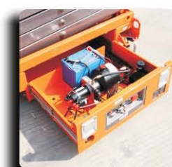
Slide Out Tray