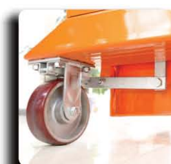
Automatic Brake System-Option