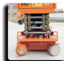
Compact Turning Radius