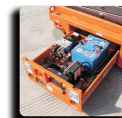
Slide Out Tray