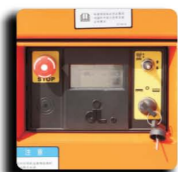
Touch Display Screen